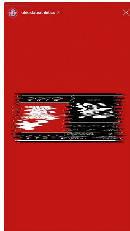
Clockwise from far left: part of Duncan's Kinetic Typography Experiments project; animation for Hype Type Studio; Instagram Stories animation; poster for Lapalux's 2018 tour; more Experiments work.